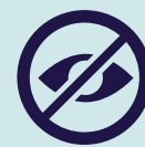
Privacy (Sect 13)