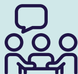
Assembly (Sect 16)