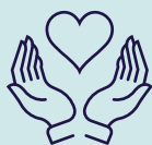
Life (Sect 9)