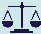
Fair Hearing (Sect 24)